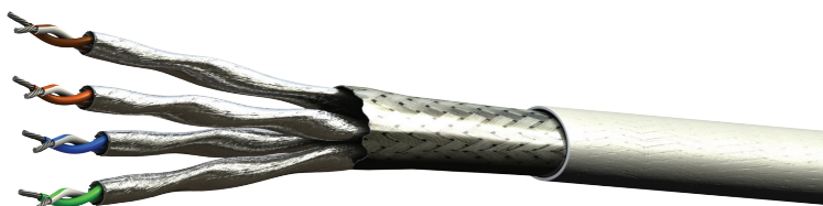
Figure 2: E74824 - CAT7

PIC's CAT7 cables perform at 10G speeds at even higher frequencies than CAT6a by individually shielding all pairs. The individual shielding significantly reduces crosstalk, increases max distance and protects signal integrity, which also makes CAT7 cables reliable solutions for low skew video applications.