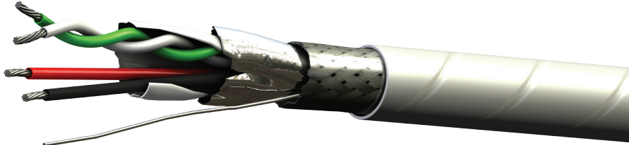
Figure 1: USB2624 (USB 2.0)

PIC Wire & Cable's USB 2.0 cables are designed for 480 Mbps applications. The cable includes one data pair with a 100% foil shield and 80% braided shield that provides robust protection against EMI to ensure signal integrity. Laser markable jacket options include a robust ETFE or light and flexible PTFE tape. USB 2.0 cables are Skydrol resistant, RoHS compliant, and meet or exceed EIA-364-XX and FAA flammability requirements FAR Part 23 and 25, Appendix F.